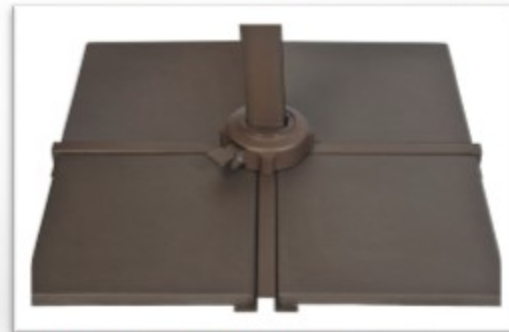
Poly Tiles & Rotation Feature