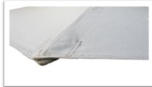
Double Needle Sewing