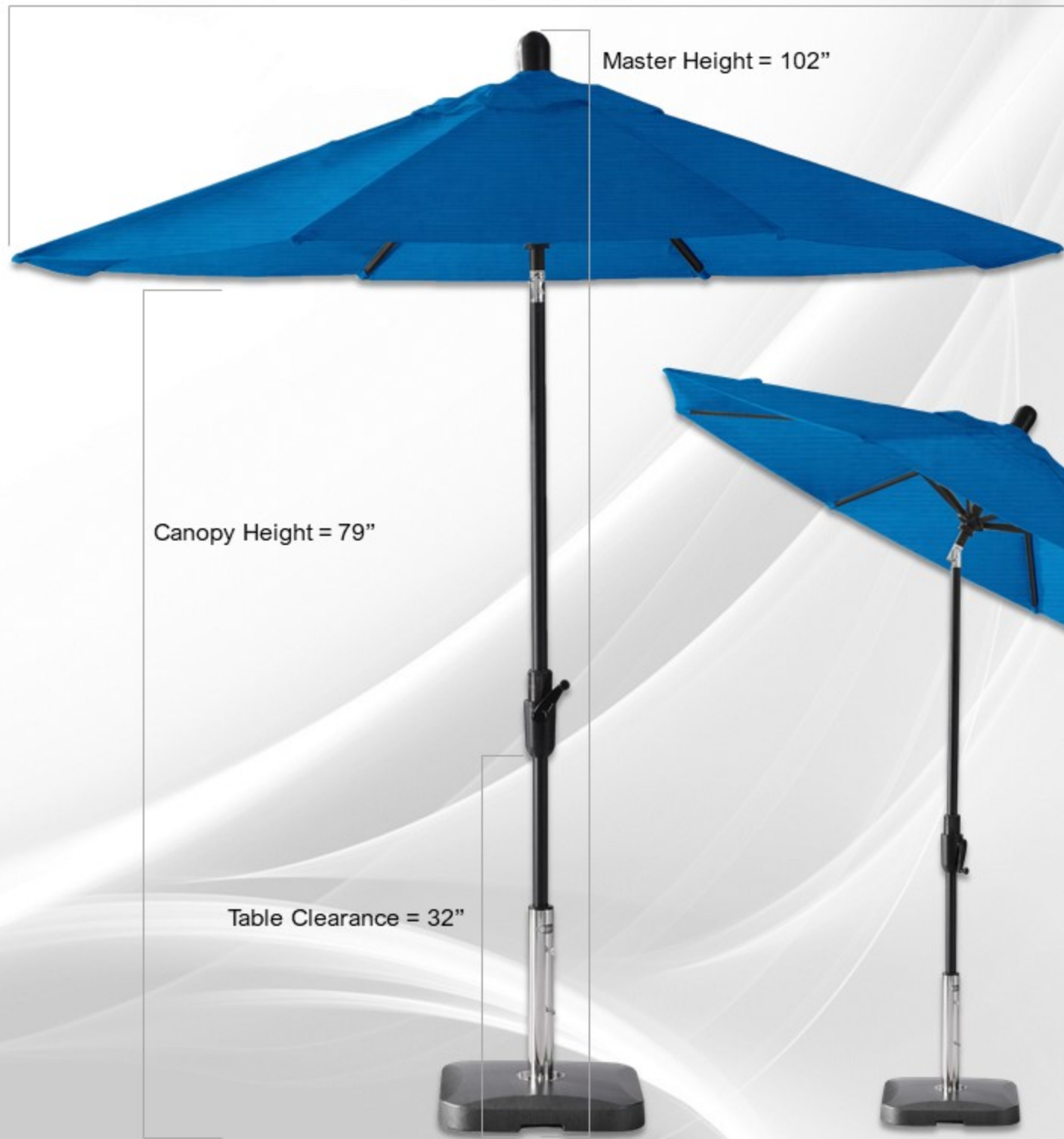
Table Clearance = 32"