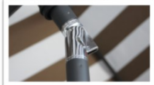
Zinc Tilt Mechanism