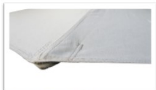
Double Needle Sewing