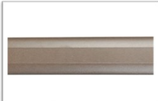
Strength Pole (Polyfiber Stone)