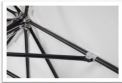
Aluminum & S.S. 304 Assembly Parts