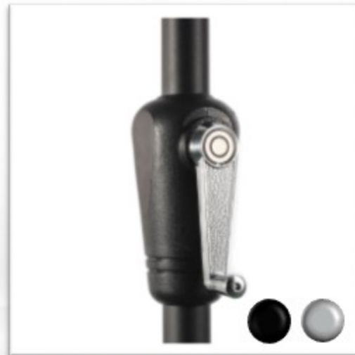
Zinc Crank & ABS Housing