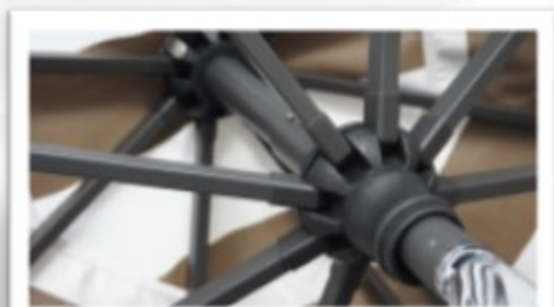
Resin Hub & Runner