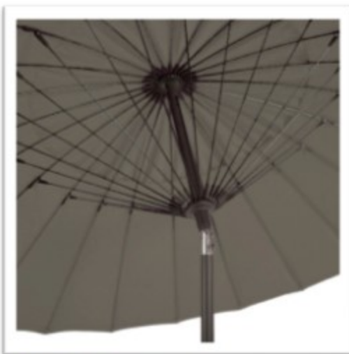
RIBS: Fiberglass Ø 0.28"