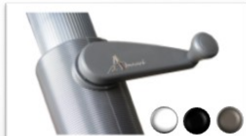
Zinc Crank & ABS Housing