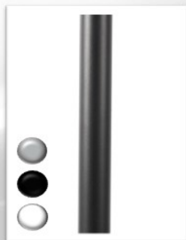
Aluminum Pole Hubs