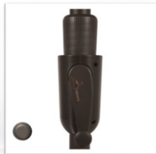
POLE: Two Pieces (T3 Aluminum) 1.5" diameter; 0.05" thickness