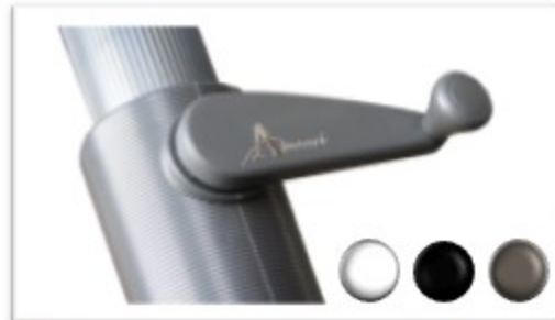
Zinc Crank & ABS Housing