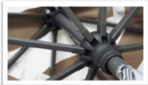
Resin Hub & Runner