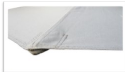
Double Needle Sewing