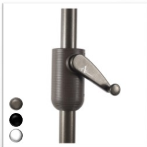
Zinc Crank & ABS Housing