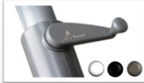
Zinc Crank & ABS Housing