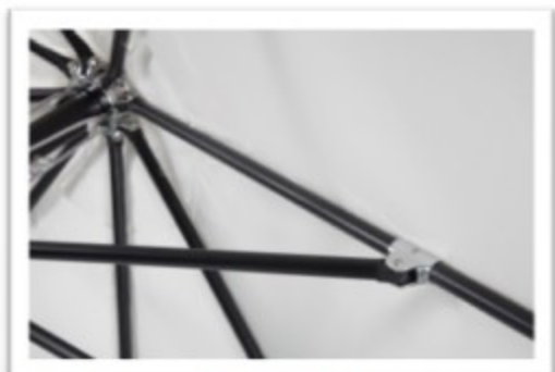
Aluminum & S.S. 304 Assembly Parts