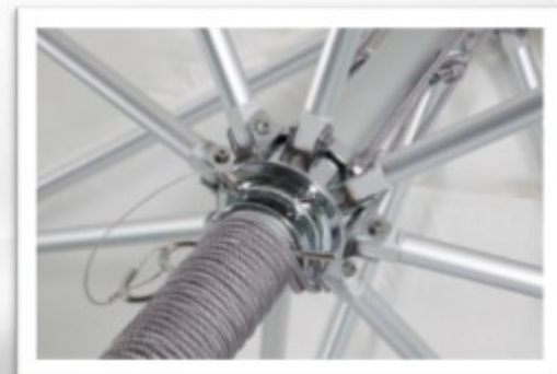
Cast Aluminum Replaceable Hubs